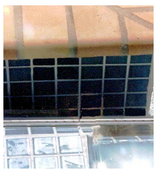
Note: Bond Beam is slanted same as side bond beam. Slant area is ½" to 1" higher than side of bond beam.