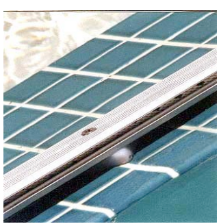
Note spacer under guide. Turn so that corner is pointing away from guide. This allows water to flow around it & under guide