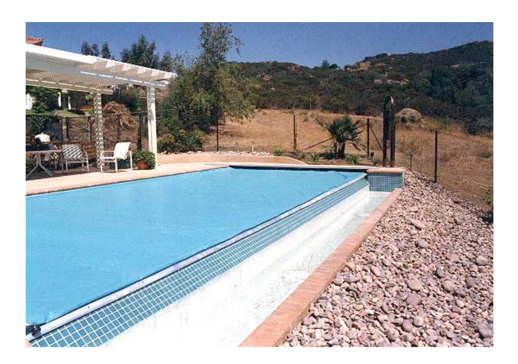
Place Top guide on tile between 2-3 inches from the top on the 45 degree slope of the outside edge of the vanishing edge.