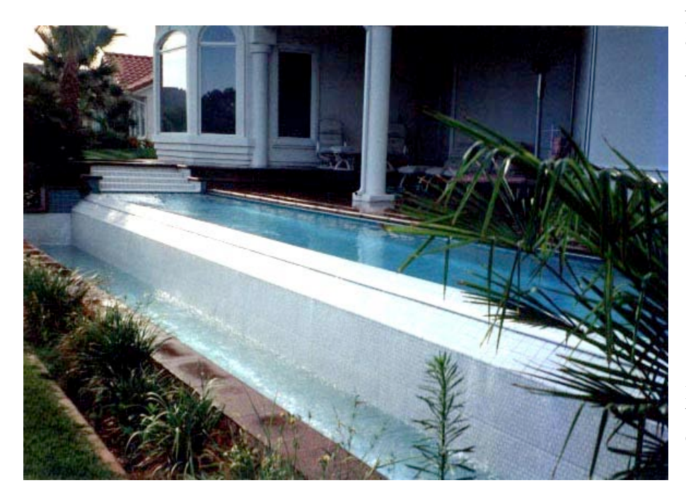
If end of pool has a raised bond beam, it must be notched for the end pulley